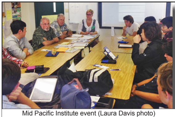
Mid Pacific Institute event